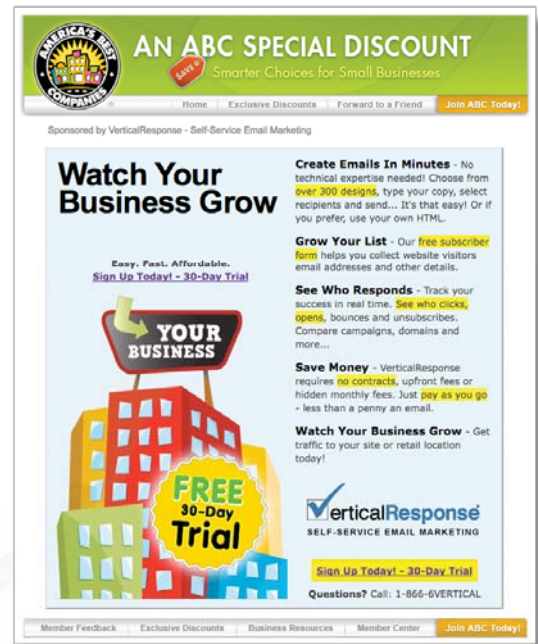
*Example for illustration purposes only.

The cost is $750 each time this email is sent. Acceptable format is HTML code with images hosted by sponsor. Flash and rich media files are not accepted.